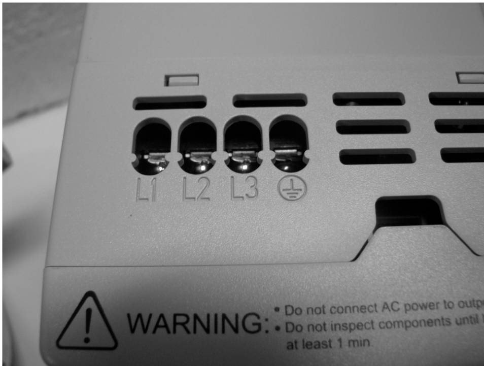
220 V input