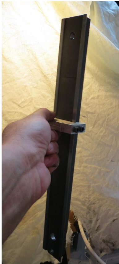
Fig.: How well does the dovetail clamp on the lathe bed? See by yourself. You can hand up a Sherline lathe bed in your shop using our dovetails. We test accessories on more than one Sherline system, of course. Making sure that variations in the production don't affect our accessories.

The Sherline cross-slide is shown in some of the images depicted here. None of the statements or procedures may coincide with Sherline's Inc. opinion or interests. Neither LatheCity coworkers nor LatheCity's owner are employees of/or agents for any of the vendors referenced in the text and they do not sell or represent any of the third party products discussed.