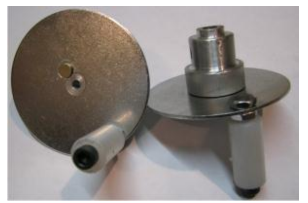
Fig.: Front and back side of the hand wheels.