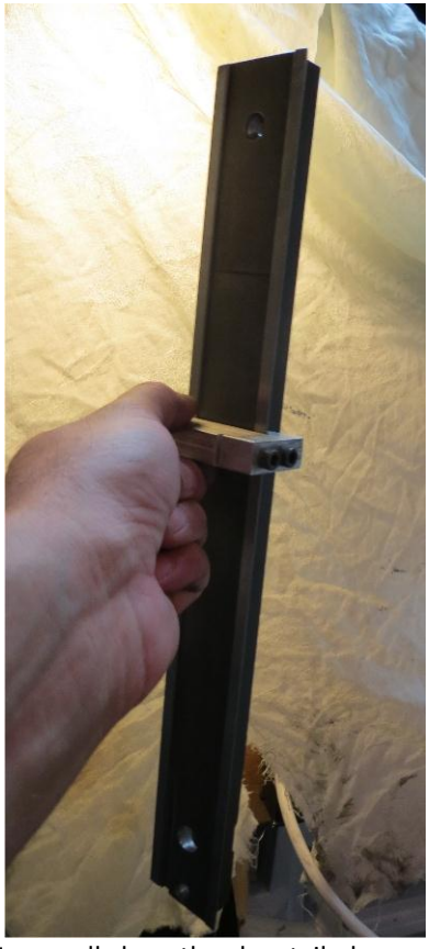
Fig.: How well does the dovetail clamp on the lathe bed? See by yourself. You can hand up a Sherline lathe bed in your shop using our dovetails. We test accessories on more than one Sherline system, of course. Making sure that variations in the production don't affect our accessories.

The Sherline cross-slide is shown in some of the images depicted here. None of the statements or procedures may coincide with Sherline's Inc. opinion or interests. Neither LatheCity coworkers nor LatheCity's owner are employees of/or agents for any of the vendors referenced in the text and they do not sell or represent any of the third party products discussed.